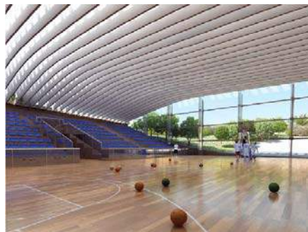
Indoor view of the upcoming Sport Complex

For more information and contacts, check usek.edu.lb .