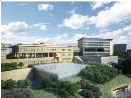
Outdoor view of the upcoming Sport Complex

To complete the picture, the new Sport complex will be built according to the highest sustainable environmental standards, including being powered completely by renewable energy. This will house the University's student sports programs - mini-football, basketball and tennis - under one roof, with facilities including training grounds, sports medicine, and offices for coaches and staff. The complex will also function as a cultural space for USEK community, housing activities such as concerts and giving students a vibrant meeting point.