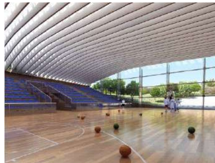
Indoor view of the upcoming Sport Complex

For more information and contacts, check usek.edu.lb .